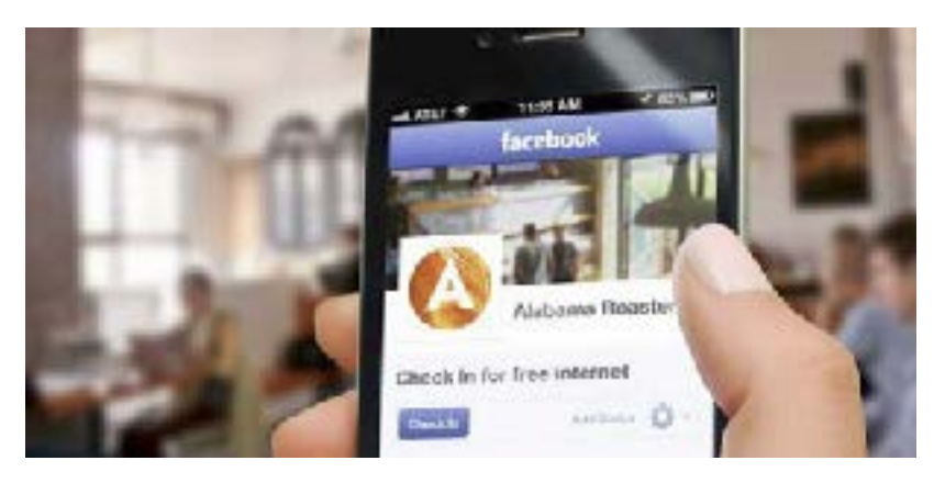
Dinner rush? No problem. Offering free WiFi can encourage customers to wait longer for available seating.